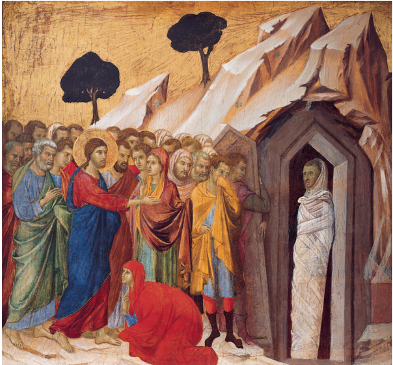
'The Raising of Lazarus', tempera and gold on panel by Duccio di Buoninsegna, 1310–11, Kimbell Art Museum. Public Domain